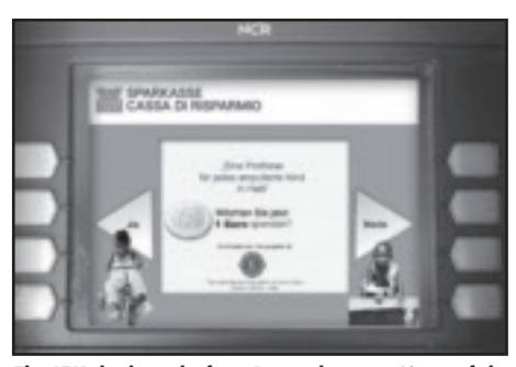
The ATM display asks for a 1 euro donation. (Some of the bank branches are located near the Austrian border, hence the appeal is in German)

Lions in District 108 TA1 arranged for signs on 170 ATM machines at 120 branches of Sparkasse-Cassa di Risparmio di Bolzano, the oldest bank in the South Tyrol region. Lions raised 40,000 euros ($56,000) in less than a year. Clubs also contributed funds on their own, bringing the total raised to 300,000 euros ($420,000).