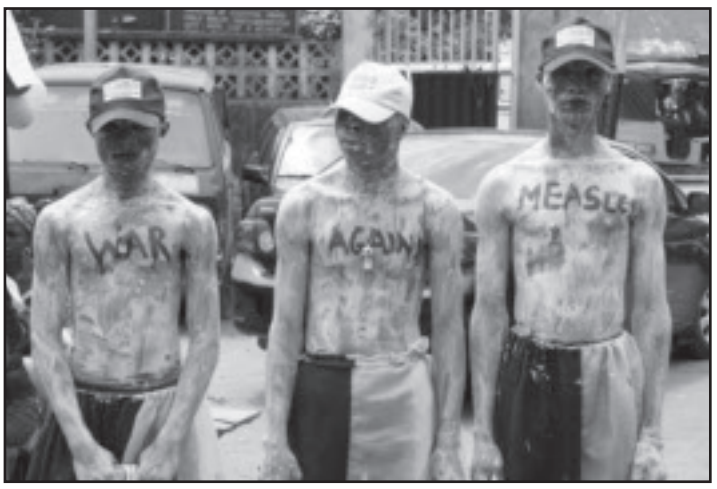
Lions help to raise awareness of the need for measles vaccinations through a public demonstration in Nigeria

To learn more about this program and grant, visit www.lcif.org.