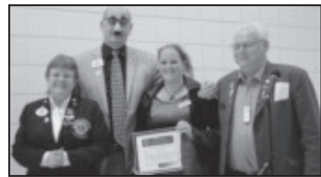
Proof you can have fun in Lionism and still get the job

The District A-15 Convention was held this year in Elmira, May 6-8, 2011. The convention was cohosted by both the Elmira Lions and the Woolwich Community Lions clubs. It was a huge success with 599 Lions registered. Along with the great food, entertainment and camaraderie there were some awards given. Six members of the Woolwich Lions Club and one from the Elmira Lions received their Long Tail Awards having visited all 53 clubs.