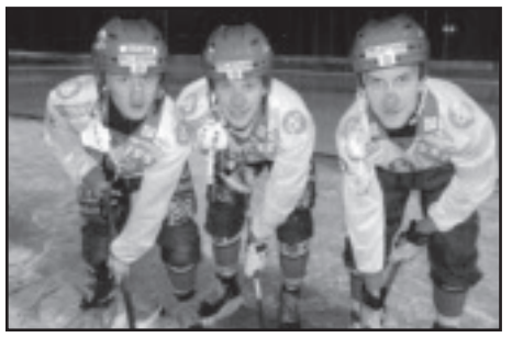
Bandy players in the National League in Finland show support for Nose Day. (Bandy is a form of hockey.)

Last year, for the first time, Lions from several clubs strapped on silly red noses and solicited donations for Nose Day. Proceeds mainly benefit the Finnish Red Cross and its projects for war orphans and former child soldiers in Sierra Leone and other developing nations.