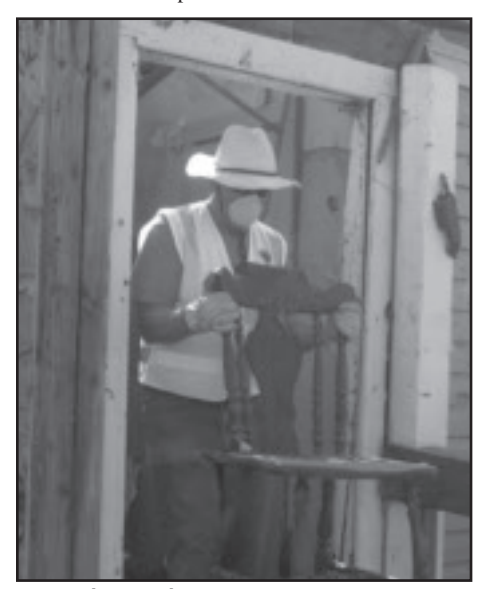
A Lion salvages a chair

The deadliest single tornado in the United States since 1947 tore a path one mile wide and 14 miles