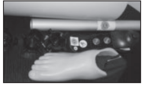
The prosthetics are high quality

So far Lions have delivered 200 artificial legs to Haiti. The goal is to help 1,500 children who lost a leg in the devastating January 2010 earthquake. The high-quality prosthetics are made in Italy with carbon fiber.