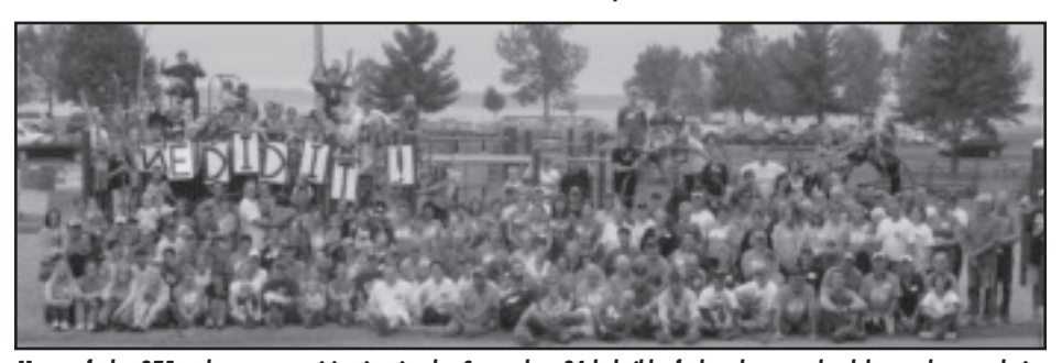
Many of the 275 volunteers participating in the September 24th build of the playground celebrate the completion of the project