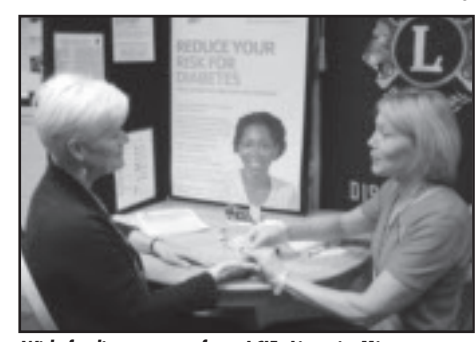
With funding support from LCIF, Lions in Minnesota are increasing their community outreach and education programs

For information on LCIF's diabetes grant programs, visit www.lcif.org