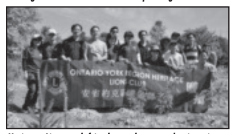
Heritage Lions and friends at the tree planting site at Austin Drive Park in Markham