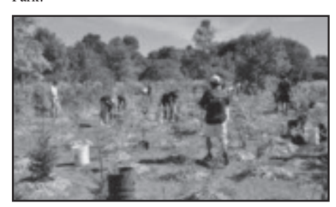
Heritage Lions in action at the tree planting site

Ontario York Region Heritage Lions Club hosted its 3rd annual Tree Planting event on September 10, 2011 at Austin Drive Park in Markham, in partnership with Evergreen and Town of Markham. With over 60 Lions and friends and volunteers coming to the Park on the day, we planted 270 trees in just 2 hours at the Park.