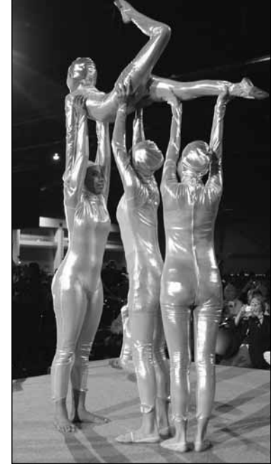
Rhythmic dancers in body suits perform at the first plenary session.

along to Brandel's theme song about everyday heroes as they waved miniature flashlights and watched a map of the world on the big screen be lit up country by country.