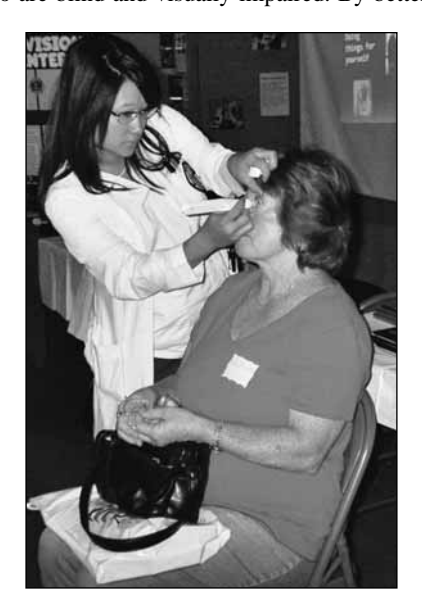
LEHP provides visions screenings for communities, in effort to educate and promote healthy eye care and annual check-ups.

"Lions have long been champions of people who are blind and visually impaired. By better