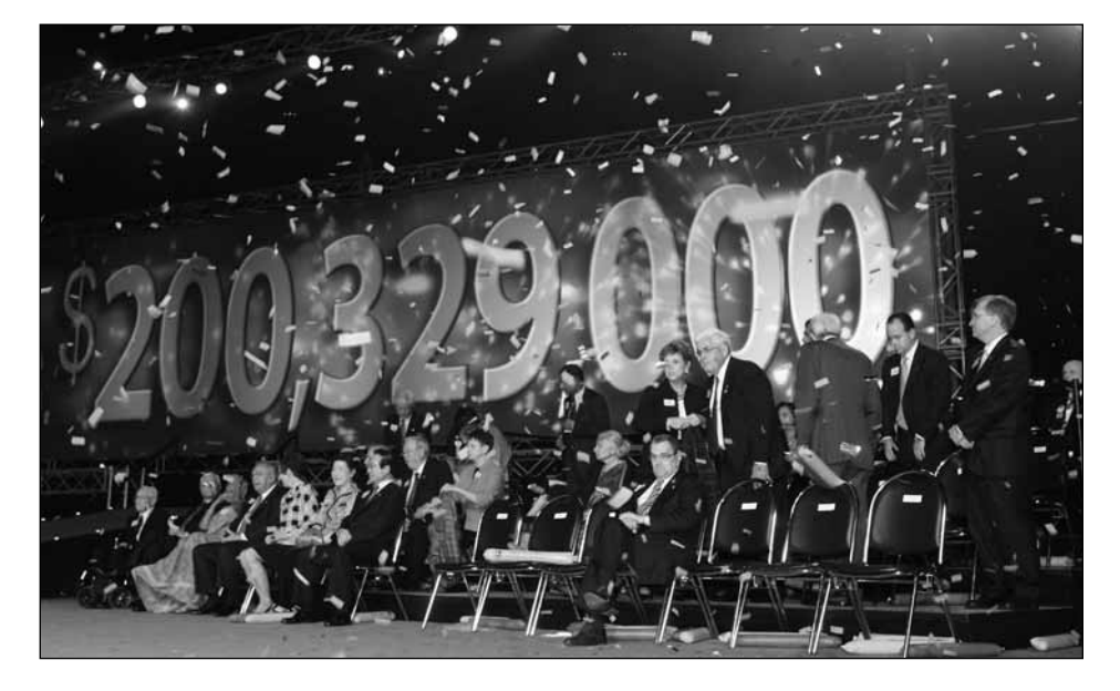
The tally for Campaign SightFirst II is unveiled in grand style at the second plenary session.

The end of the convention was about new beginnings. In the plenary hall, the newly elected international directors were introduced and the 2008-2009 district governors pulled off their district governor-elect ribbons, signifying the start of their leadership—a year to continue time-honored service projects as well as to start new traditions.