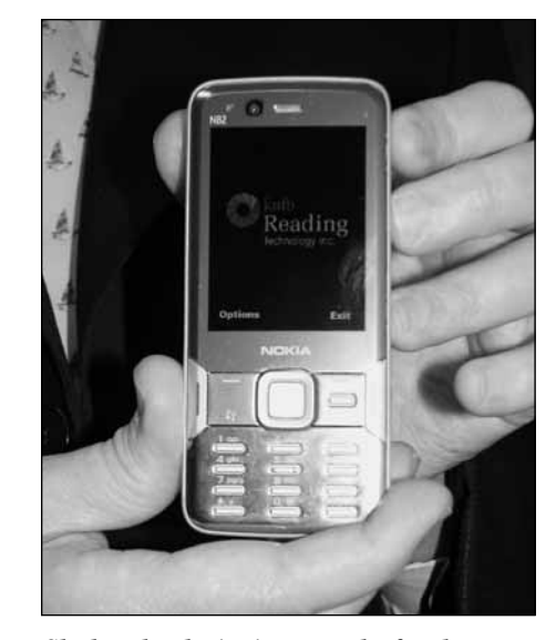
Sleek technologies increase the freedom of the blind. BrailleNotes (top) is a small computer. The Trekker (center) combines speech output with GPS technology to increase mobility. The K-NFB Mobile Reader (bottom) reads aloud menus, receipts and paper money.