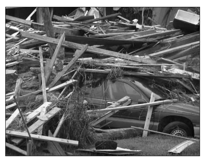
The Slidell area had to pick up the pieces.

Chicago in 1917. The Slidell Lions helped their town grow and progress. They knocked on doors to collect the data for the first telephone system. They made the streets safe for the increasing auto traffic by raising funds for speed limit and school zone signs. Through the years they took care of the less fortunate by distributing gift baskets and eyeglasses.