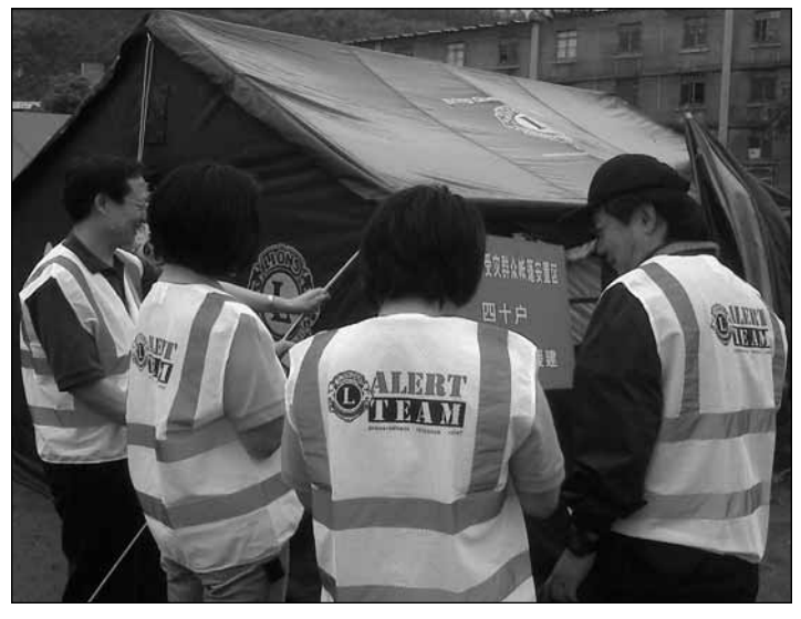
Lions erect thousands of tents to house victims and relief workers.

There are more than 2,000 Lions in China, where Lions Clubs International is the country's only official international volunteer service club organization. The first club began in 2002; however, Lions have a history of working with the Chinese government, dating back to 1999 when Lions launched SightFirst China Action. LCIF gave $30 million, which the Chinese government matched, to train eye health care workers in 100 provinces and provide more than 5 million cataract surgeries.