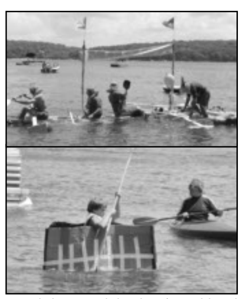
Deep Creek Lake Lions in Maryland award prizes for Most Likely to Sink and Best Use of Duct Tape in its build-your-own-boat race

Lions Clubs are all about experience, and what's fun varies from club to club and even Lion to Lion. Age and gender affect someone's notion of fun, as does geography. Clubs need to know their communities and their members.