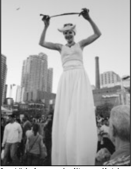
Toronto's Harbourfront stages a slew of big events and festivals

Yes, hockey. Lacrosse is officially the national sport, and Canadians claim to have invented football. But hockey remains an all-consuming passion among Canadians-their equivalence of mother and apple pie. Lions won't be able to skate outdoors in July (the weather likely will be warm and sunny). But they can visit the interactive Hockey Hall of Fame and call a playoff game, pretend to be a goalie and pose with the Stanley Cup. Another appeal to this hockey mecca is that its focus is international including exhibits on the "Miracle on Ice" U.S. Olympic squad, national teams like the Finns and even women's hockey.