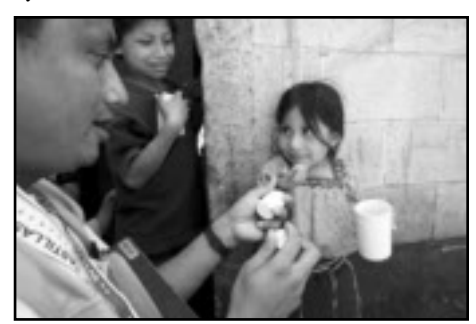
A Guatemalan health worker provides Mectizan® to a child. Guatemala announced that it had interrupted river blindness transmission in 2011 and stopped all treatment activities in 2012

River blindness is a disease caused by worms that originated in Africa and was likely brought to this hemisphere by the slave trade back in the 1700s and 1800s. When The Carter Center adopted river blindness as one of our targeted diseases, it existed in six countries in Latin America: Brazil, Colombia, Ecuador, Guatemala, Mexico and Venezuela. We began to see this as a relatively milder form of onchocerciasis than existed in some places in Africa for several reasons. One of the most important is that the little black fly that transmits the disease in Africa is much more efficient than in Latin America. Another is that only about 600,000 persons in six countries were at risk for river blindness in Latin America, compared to millions in Africa. So we saw Latin America is a good region to try new ideas that could lead to elimination.