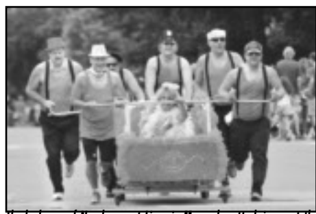
The bed race of Newburyport Lions in Massachusetts brings out the zany side of residents.

Even in a world of instant tweets and global CNN, people retain rich geographical differences that shape their ideas of fun. The Chilliwack Stellers Jay Lions Club in British Columbia, Canada, finds fun in catering memorial teas and other foodie events.