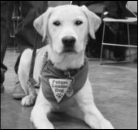
Leader Dog puppies wear blue bandanas while they're "on duty" to represent a blind handler's harness

Iowa Falls. The students help puppies gain important experiences they can't get "inside" such as children, traffic, crowds and public places.