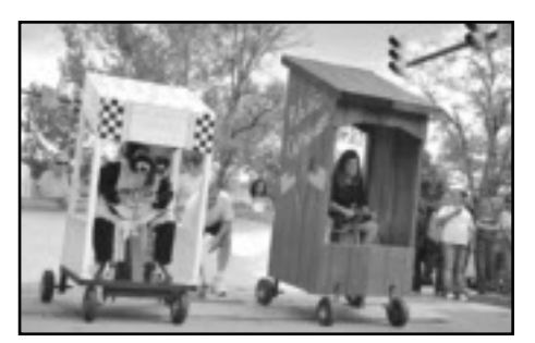
Brown County Lions in Indiana take part in an outhouse race

or a hot wings cooking contest. Older members push back with the five words that murder change: "We've never done that before."