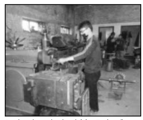
A worker makes a turbine drive shaft for a Nepalese village

Lions gave the energy company a universal drilling machine and a refurbished turning lathe and provided on-site training. The club also underwrote the electrical engineering education in England of the son of the company owner. The end result has been a string of villages with small power stations of 10 to 100 kilowatts and communities better able to feed themselves and others.