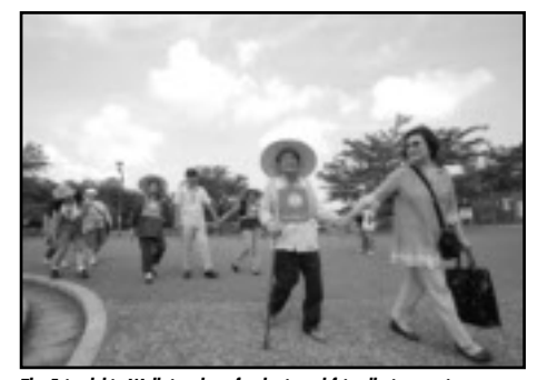
The Friendship Walk involves fresh air and friendly interaction

That was the whole point of the outing: not giving or receiving service but having fun together spontaneously. That's how it's been for this club and those with muscular dystrophy since 1974. Each year Lions and people with the disease enjoy an activity together with no service strings attached.