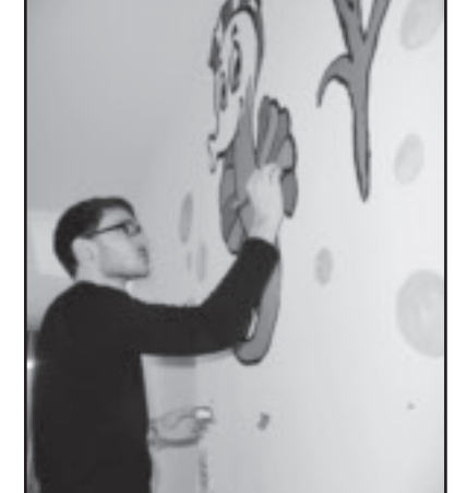
Neu Ulm Campus Lions beautify a children's camp during the Lions' semester break