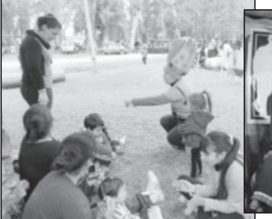
Ensenada Lions play with young children at their "Children's Day." Children received shoes, toys and school supplies