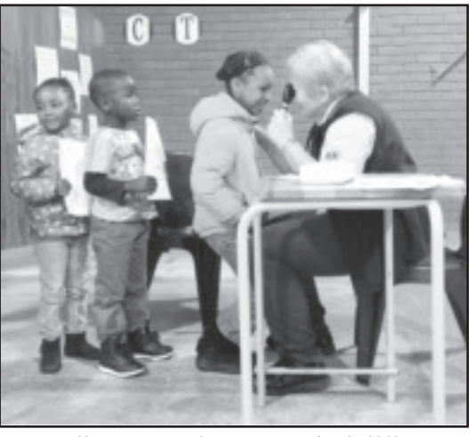
Table View Lions provide vision screenings for schoolchildren