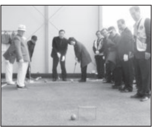
Senior citizens play gateball. The New Changwon Lions awarded prize money to the top competitors of the tournament, which raised $6,500 for the club's charitable causes