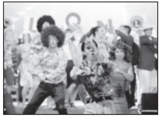
A disco party erupts before the closing plenary session

something we need to do, year after year."