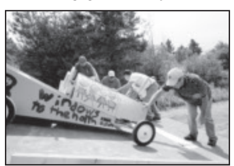
Lions help set soap boxes in place on the ramp

The Magnetawan Lions sponsored and assisted with the First Annual Soap Box Derby held in Magnetawan, Ontario on August 8, 2015. The event was organized by the Magnetawan Recreation Committee. 15 children ages 8-13 participated in the event. Over 400 people attended this great local event.