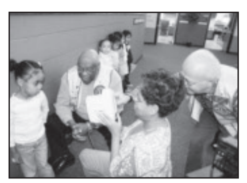
Lions clubs across the country, like this one in District 14 T in Pennsylvania, host vision screenings for children

Information on how clubs can apply for an LCIF Standard grant is at lcif.org. U.S. clubs and districts can visit KidSightUSA.com to get involved in screening children.