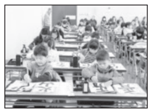
Students in Noogata take part in the calligraphy competition

The competition is helping fuel a growing interest among youths in calligraphy. The high school calligraphy club displays its work at a local crowded shopping mall, where the art from the Lions' event also can be found. The lasting visibility of the Lions' project has pleased Lions, who sometimes find that their activities fall into a "pay and forget" rut. The colorful, complicated art leaves a solid impression.