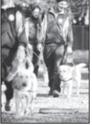
Guide dogs are trained in Italy

The facility is only not а training place but will function as an advocacy center for those who are visually impaired. Lions in Italy now are focused on promoting the dignity and rights of those with vision impairments.