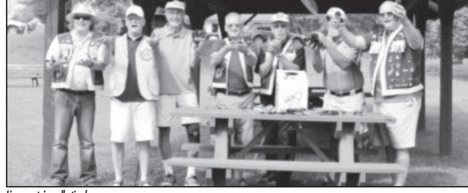
Lions emptying collection boxes The LION September/October 2015