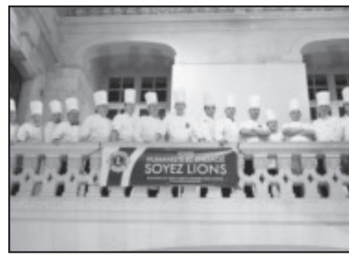
French chefs volunteered their skills to help Lions help others

Lions raised 17,000 euros (US$19,000). Funds went to a cancer group, for audio books and to entrepreneurs, who accepted the interest-free loans to establish their businesses.