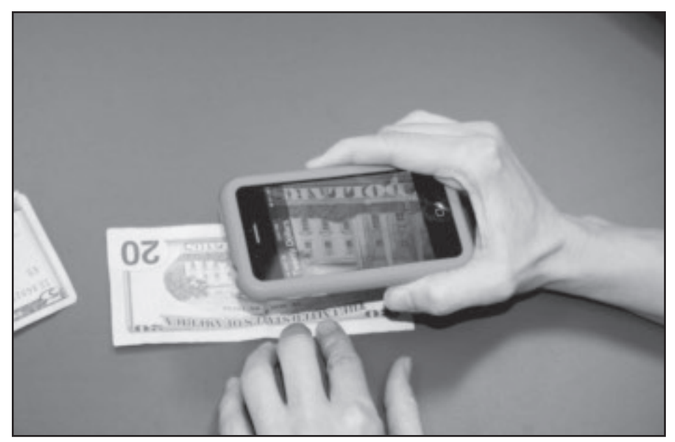
Technology such as the iPhone money identifier can be immensely useful for those with vison impairments

"At the end of the year, we hope we'll have something that's been proven to be useful, and that we can show that we're capable of growing with additional funding. It's a huge undertaking. We're a relatively small organization trying to tackle a big mission across a lot of areas. But it's hard to overstate the importance of access to technology for people who are blind. Sometimes I bristle when people say, 'Technology's only part of the answer.' Yes, but it's a huge part of the answer."